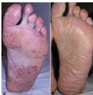
Fig. 1. View of pustular lesions on the plantar area of the patient's left foot, (a) before and (b) 5 weeks after treatment with adalimumab.

Laboratory tests, including C-reactive protein, erythrocyte sedimentation rate, viral serology tests and antinuclear antibodies showed no abnormalities. Test for HLA-B27 was negative and a thrombophilia work-up revealed only heterozygosis for the MTHFR gene. Bacterial cultures from pustules were negative. Thus, the patient was diagnosed with sterile plantar pustulosis. Thoracic X-ray showed an increased density in the right sternoclavicular joint, and three-phase bone (Tc-99m) and gallium scans revealed a non-infectious uptake in the right sternoclavicular and manubriosternal joints and tarsal bones of her left foot (Fig. 2). A thoracic and abdominal computed tomography (CT) scan revealed no abnormalities. With all these findings fulfilling the diagnostic criteria, SAPHO syndrome was diagnosed.