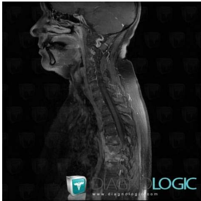
Here is the specific information in the key image above: - Diagnosis SAPHO syndrome, Location(s) Vertebral body / Disk, with gamuts