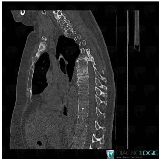
Here is the specific information in the key image above: - Diagnosis SAPHO syndrome, Location(s) Vertebral body / Disk, with gamuts Focal area of sclerosis in a vertebra