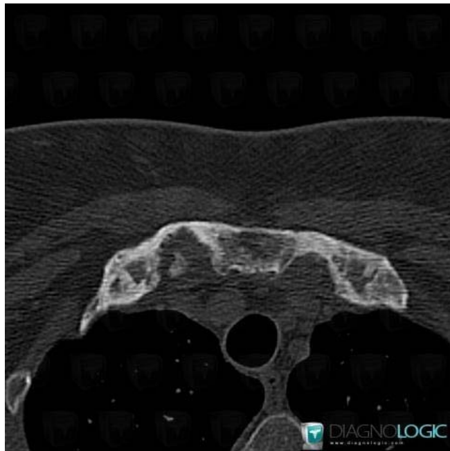
Here is the specific information in the key image above: - Diagnosis SAPHO syndrome, Location(s) Costosternal / Sternoclavicular joint and Costal cartilage, with gamuts